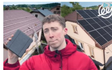
Electricians Agree: Solar is only worthwhile if your roof...