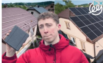
Electricians Agree: Solar is only worthwhile if your roof...

"We're waiting for Brent and Veolia to determine whether the mound is safe to use. We'd also like to know who were allowed to dump waste there and who in the council signed that off? In the long term the friends would like to see the cemetery remain and retained for non commissioned use."